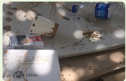
Cigarette butts discarded into non-approved general, recycling waste bins.