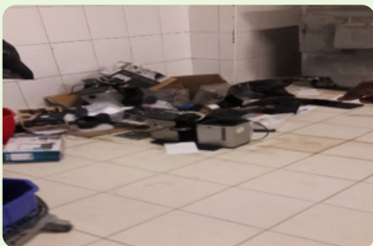
Electronic waste dumped inside the waste room, presenting fire, slip, trip or fall hazard.