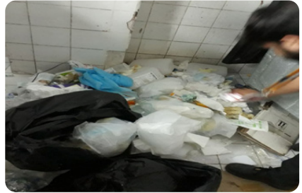
Incorrect disposal of clinical waste in the wrong waste stream.