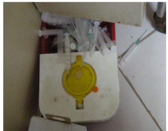
Overflowing sharps box