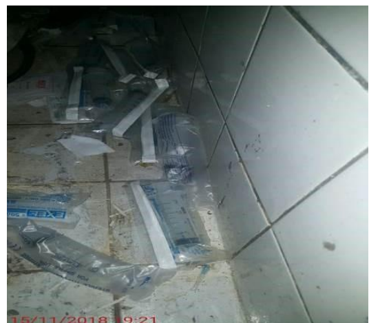
Sharps disposed in general waste rooms