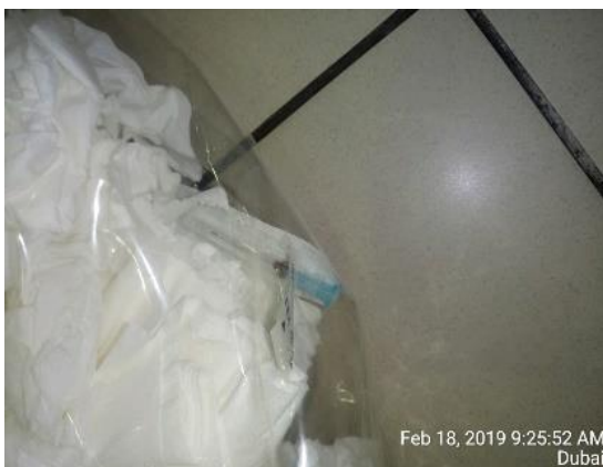
Syringes disposed with general waste