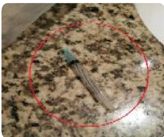
Syringe discarded incorrectly